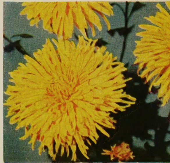
LEE POWELL. 60c each; 3 for $1.50

6 BIG FLOWER Collection All very large and early flowering kinds. Flowers up to 5 inches if disbudded. 6 Sure-to-Bloom Plants $3.75 (1 of each pictured)